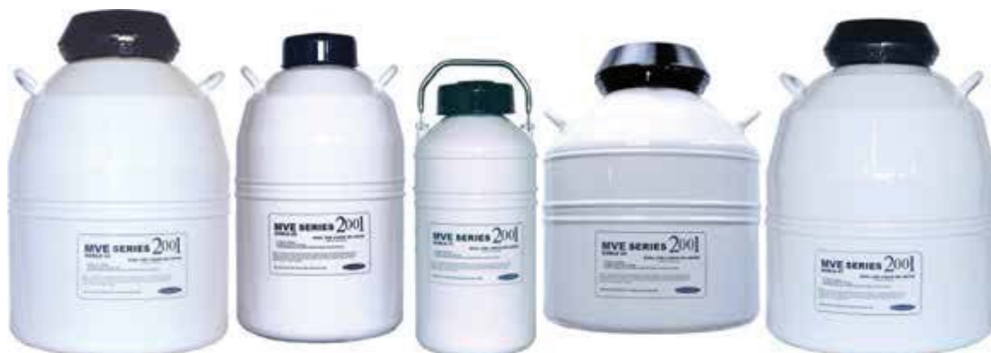
Chart MVE Doble Series Aluminum Tanks

The MVE Doble Series aluminum tanks are designed for both vapor shipment and liquid storage. These tanks utilize the same components and vacuum technology that make our current range of aluminum tanks the best-selling breeder units on the world market. The unique absorbent layer in the base of these storage units enables the tank to be charged with liquid nitrogen in as little as two hours, and they can be employed as a dry shipper. When a Doble tank arrives at its destination, the tank can be filled with liquid nitrogen and used as a long-term storage tank, therefore avoiding the need for return shipments.