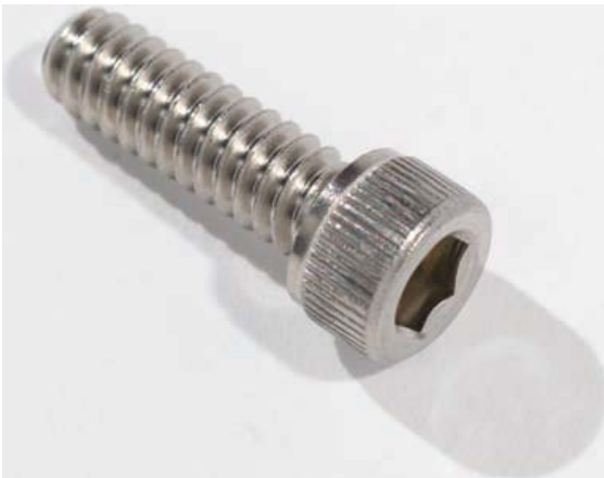
PN: 2910221 Hex Screw PN: 10987831 Hex Key

The IATA shipping container is used only in the IATA CryoShipper and is intended for safe delivery of biohazards. The container is held closed by six screws.