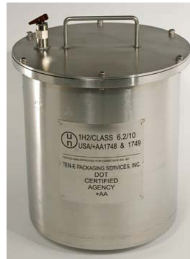
PN: 10862106 Secondary Container